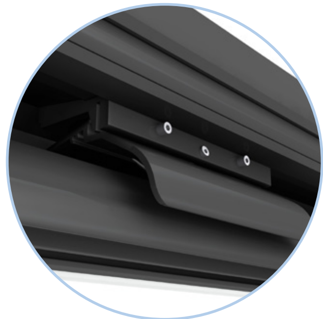
Evolution Tip-In Window Sash Strike Close-up