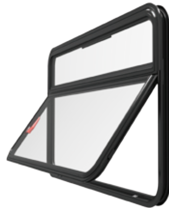
Evolution Series Tip-in Egress Window Hinged at horizontal transom resulting in egress opening that is approx. 70% of total window opening.