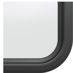
Clampring with fastener cover