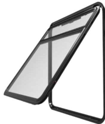
Obsolete Classic Series Tip-in Egress Window Hinged at top of window resulting in egress opening that is 100% of window opening.