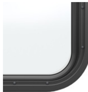
Clampring without fastener cover