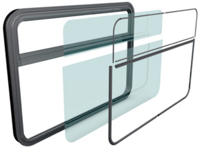
Standard Glazing – Multi-piece spline

All of our standard glazing windows can be upgraded to Quick Change by changing out the multi-piece spline with the G3 Welded Spline. The G3 Spline can be sourced from any after-market provider of AROW Global products.